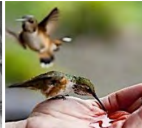
Slow Down to Go Fast