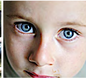
See with New Eyes