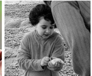
Make the Invisible Visible