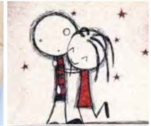
Fall in Love