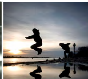
Jump into Ambiguity